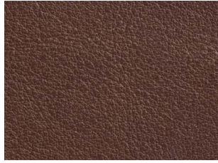
ART05 Good Earth