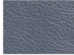
LL0010 Steel Blue