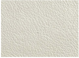
LL0004 Mother of Pearl