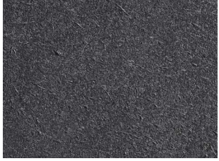
RS25 Coal Ash