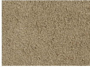
RS05 Paper Bag