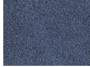
RS42 Tile Blue