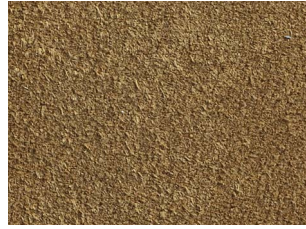
RS06 Tiger's Eye