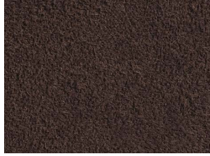
RS31 Pitch Brown