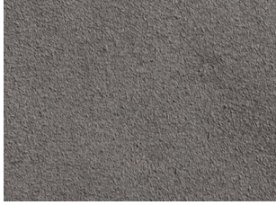
RS57 Gray Silk